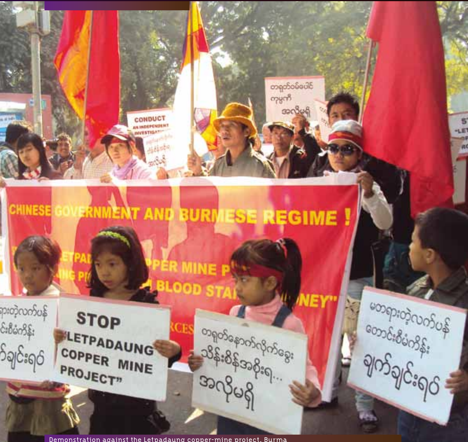
Demonstration against the Letpadaung copper-mine project, Burma